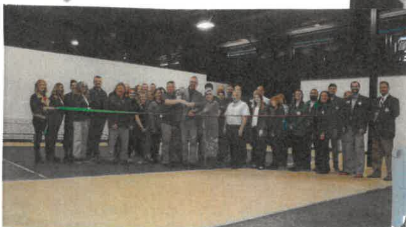
UFITNESS MARCH 1ST