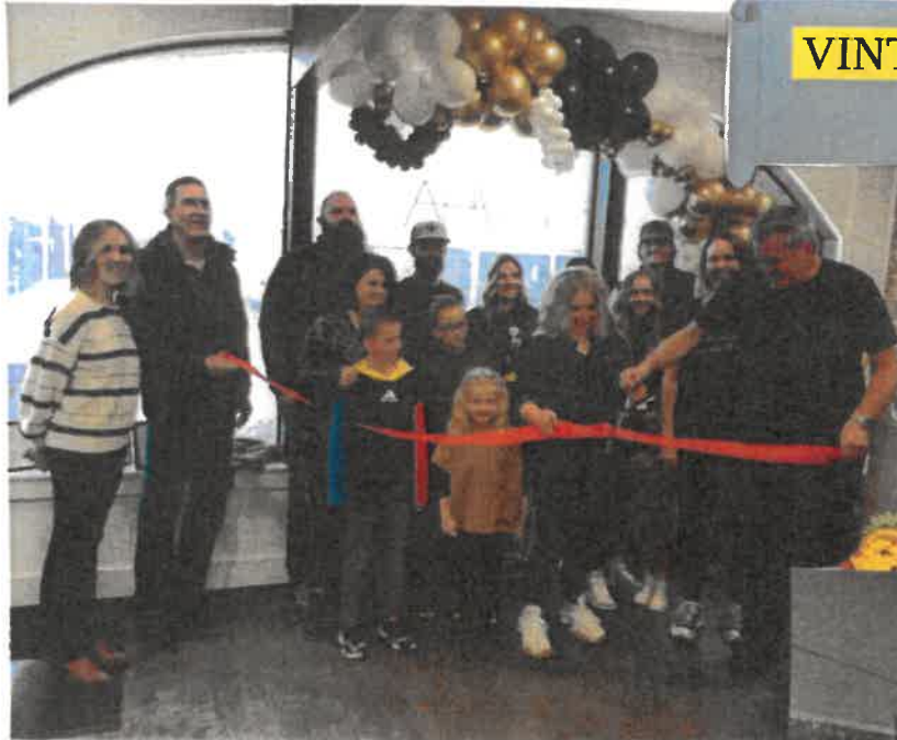
VINTAGE HOUSE OF AESTHETICS FEB. 18TH